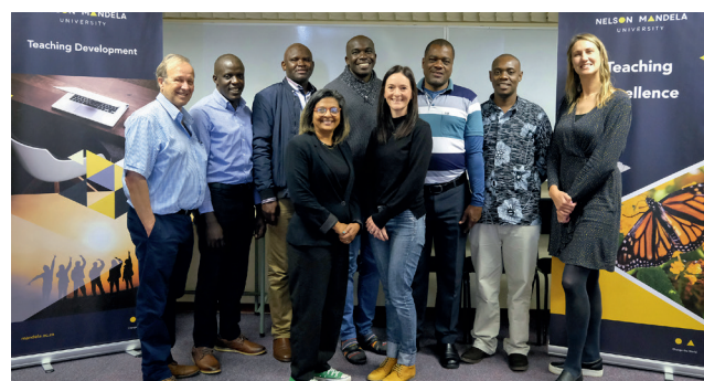
Training with centre CEMEREM in Port Elizabeth, 2024