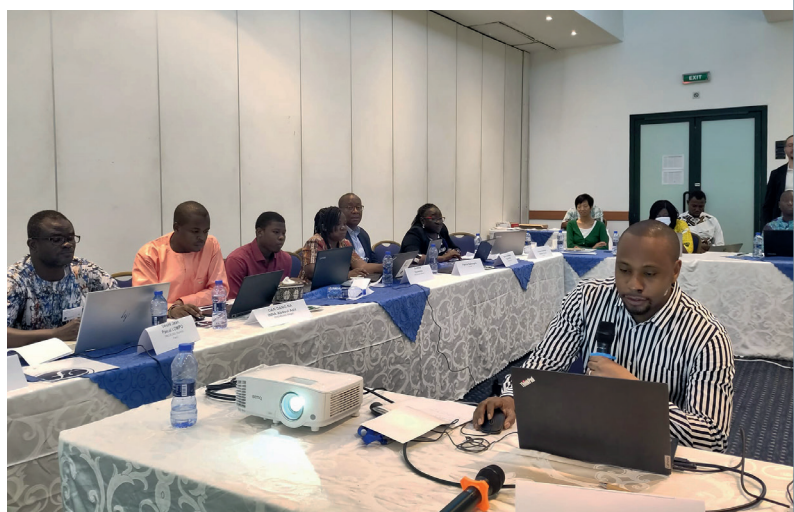
DIGI-FACE centre admin training in Accra, September 2023