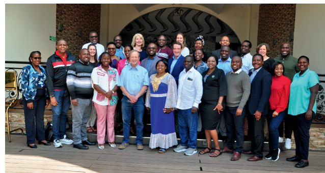
Regional Moodle training in Eldoret, October 2023

academic community. The 53 research publications from the centres show the wide range of scientific topics, reflecting the diverse interests and expertise of the DIGI-FACE community.