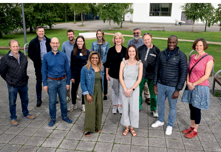
Project meeting in Oldenburg, July 2023