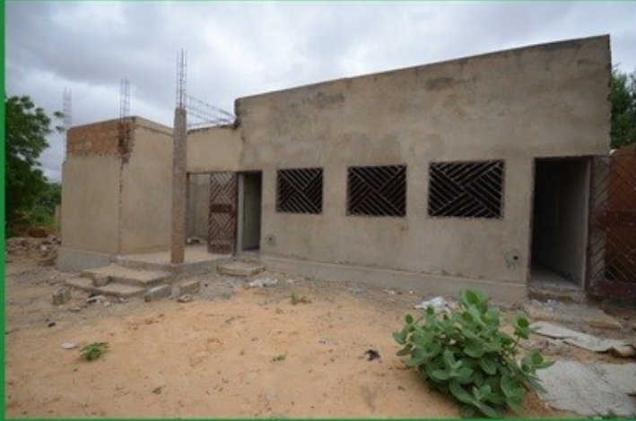
Ongoing constructions of class rooms in Niamey, Niger